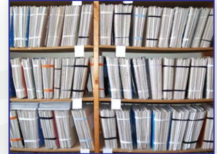
Roll up your sleeves and dig in!

Which one would you rather search through?