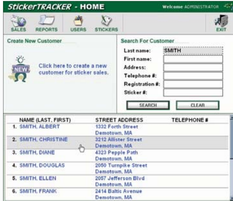
Search and retrieve existing customer information quickly.

Local municipalities sell beach, transfer station, park and various other vehicle stickers by the millions each year. Despite high volume sales and the vital revenue stream that this creates, available "off the shelf" solutions for Point-of-Sale (POS) software is limited. Bonsai Logic has recognized and addressed this vital gap with StickerTracker™. StickerTracker™ is a fully-featured and customizable Point-of-Sale (POS) solution. Bonsai Logic is ready to start improving your efficiency and saving your municipality money today!